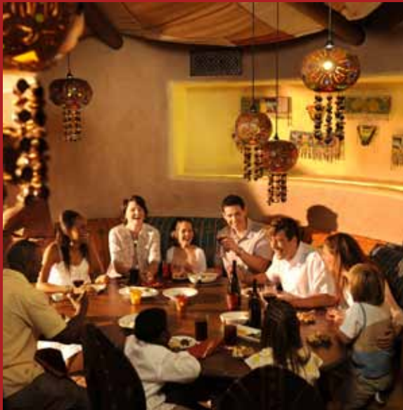
Sanaa at Disney's Animal Kingdom Villas - Kidani Village