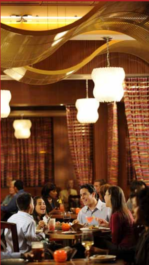
The Wave at Disney's Contemporary Resort